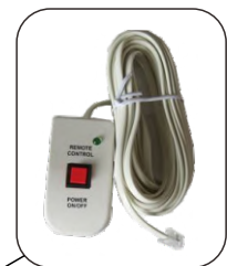
Order No.: RC-1700